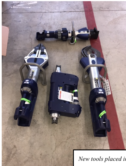
New tools placed into service.