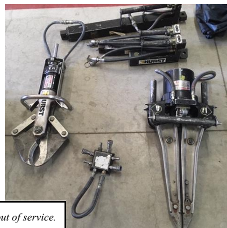
Old tools taken out of service.

As you are aware, both districts were recent recipients of new Hurst Edraulic technology automobile extrication tools through a regional Assistance to Firefighters Grant (AFG) awarded to North Tahoe, Northstar, and Truckee Fire Departments. These tools were placed into service last week on District apparatus and have already been used on vehicle accidents requiring patient extrication. These new tools replace our old inventory of hydraulically-powered tools -- some of which were placed into