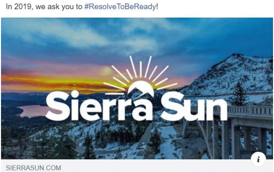
Chief's Corner: In 2019, Resolve to be Ready As we consider setting New Year's Resolutions for 2019, North Tahoe Fire...